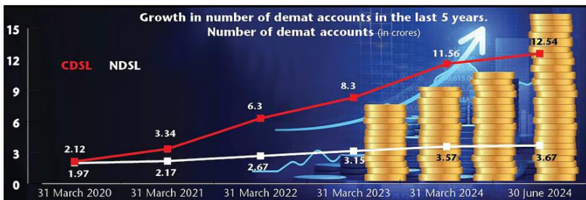
Figure: Growth in Demat Account

The role of retail investors in financial markets has grown significantly in recent years. In India, retail investors contributed around 52% of equity trading volumes in 2023, compared to 42% in 2019, reflecting a surge in participation through digital trading platforms (Joseph, 2024). Similarly, in the United States, retail investors accounted for nearly 23% of equity trading activity in 2022, a sharp rise from just 10–15% a decade earlier. The COVID-19 pandemic accelerated this trend globally, as millions of individuals entered stock markets, motivated by low-cost trading apps and higher risk appetite (Bihari et al., 2025).